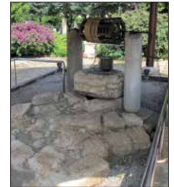
Paul's Well in Tarsus, Turkey

Tarsus lay on one of the great trade routes of the ancient world. A prosperous city, it was well-known for its linen and cilicium, a cloth made from the hair of the black goats found in that area. It was a thriving university town with numerous 'schools of rhetoric', the ancient equivalent of our modern-day liberal arts colleges. It ranked after Athens and Alexandria as the third most important centre of learning.