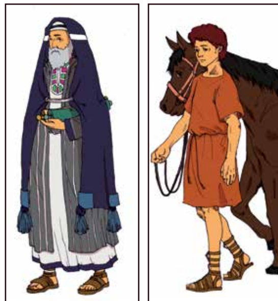
Hebraic and Hellenistic Jews

In the Diaspora throughout the Greco-Roman world, the Hellenists would be the majority of resident Jews while the Hebrews would be recent immigrants from Palestine or members of families who made a special point of preserving their Jewish ways. We know from inscriptions in synagogues in Rome and Corinth that each of these Gentile cities had a synagogue for the Hebrews.