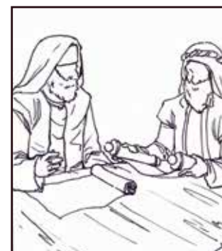
1. The Pharisees