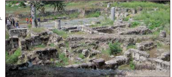
Ruins of the old agora market place in modern Tarsus, Turkey

Tarsus in what is now Southern Turkey has a rich history stretching back some 4000 years. It was the capital of the Roman province of Cilicia Pedias. Apparently the famous Mark Antony and Cleopatra had their romantic first meeting in this city. When Tarsus became part of the Roman Empire, Mark Antony granted it freedom and immunity from imperial taxation as a reward for its loyalty after Caesar's assassination in 44 BC. Later, Roman citizenship was given to the leading personalities of the city.