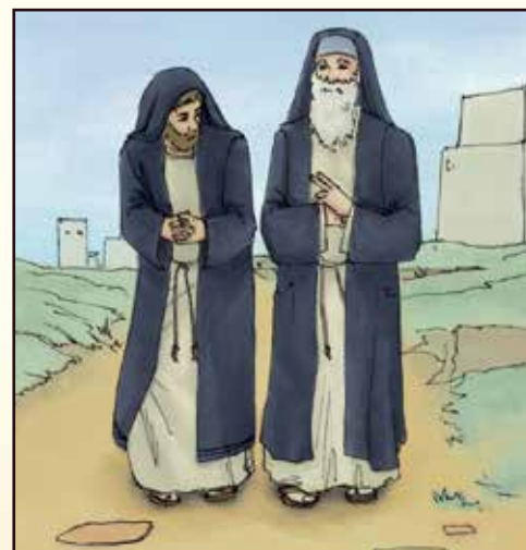
Gamaliel I - Paul's teacher

was a Tarsian and a Roman, he was first and foremost a Hebrew at heart. It is similar to modern-day immigrants who might be patriotic citizens of the countries they live in but who still identify strongly with their ethnic roots and heritage.