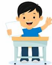
Asking a question