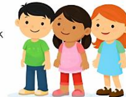
Lining up quietly