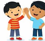
Giving a high five